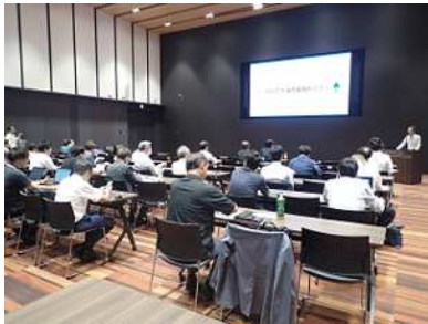
A scene from the assembly