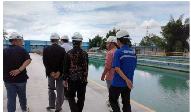
Site visits of the water purification plant