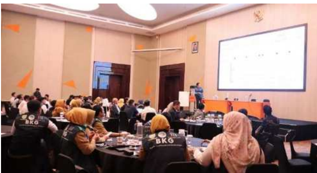
Staff training (Bandung)