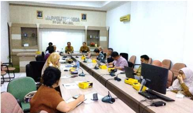
Meeting with officials from relevant local organizations