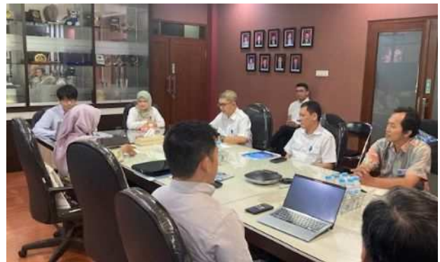
Meeting with officials from relevant local organizations