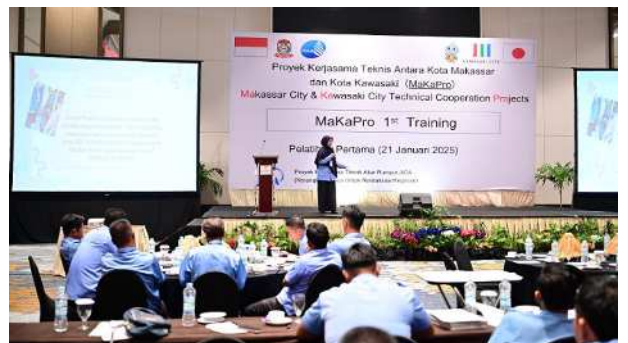
Staff training (Makassar)